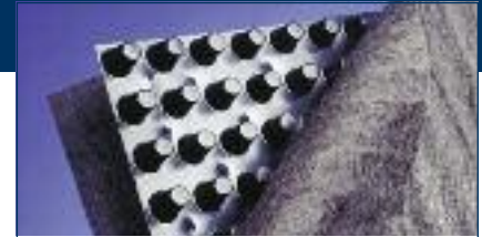
Mirafi® G Series Drainage Composite

Mirafi® G Series drainage composite G100N products are designed for use in high-flow, high compressive strength, vertical applications where single-sided subsoil drainage filter layer is needed. The flat side of the core fits directly against wall surfaces making it ideal for retaining walls, bridge abutments and other similar retaining structures. Mirafi® G Series drainage composite G200N is designed for use where single or double-sided subsoil drainage filter layer is required.