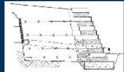
Retaining Wall Interceptor Drain

TenCate™ Geosynthetics North America assumes no liability for the accuracy or completeness of this information or for the ultimate use by the purchaser. TenCate™ Geosynthetics North America disclaims any and all express, implied, or statutory standards, warranties or guarantees, including without limitation any implied warranty as to merchantability or fitness for a particular purpose or arising from a course of dealing or usage of trade as to any equipment, materials, or information furnished herewith. This document should not be construed as engineering advice.