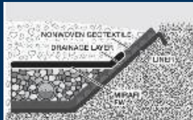
Leachate Collection System